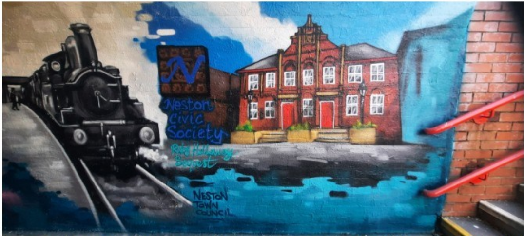
A steam train, Neston Civic Society logo, and Neston Town Hall