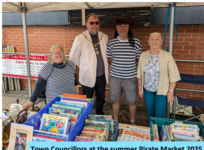
Town Councillors at the summer Pirate Market 2025

My thanks, as ever, go to our dedicated markets team and the traders who support us each week, come rain or shine, and we have had a lot of rainy Fridays this year! Thank you shoppers for supporting Neston Market we really do appreciate it.