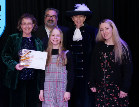
Awards photo: Stephen Cain photography